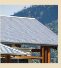
ROOF COLOUR: SHALE GREY™

Advanced paint technology in COLORBOND® steel provides your roof with a durable, baked-on paint finish that resists peeling, chipping and cracking.