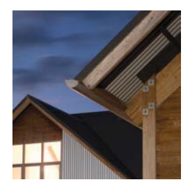
ROOF COLOUR: IRONSTONE®

THE COLORBOND<sup>®</sup> STEEL RANGE OF DESIGNER COLOURS OFFERS A CLASSIC AND CONTEMPORARY PALETTE TO ENHANCE THE BEAUTY OF EVERY HOME STYLE. Where better to look for inspiration than in Australia's own magnificent backyard. From our mountains to the outback, from creek beds to beaches, COLORBOND<sup>®</sup> steel captures the light and energy that makes Australia's colours so unique. You'll find 22 colour choices to create the ideal look and feel for your home.